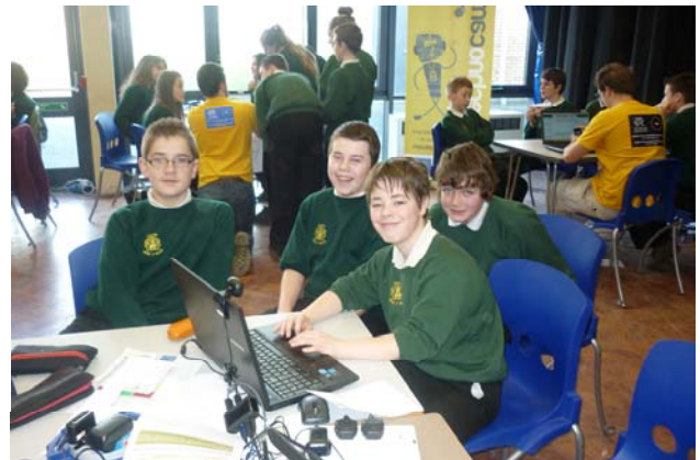
Bl 9 yn mwynhau y gweithdai Technocamps